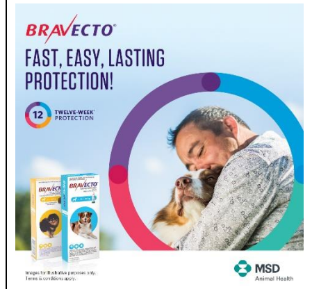
Post 7: Fast Protection

Bravecto® starts killing parasites within 2 hours and keeps going for 12 weeks. And it takes just one dose.