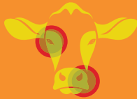
U bva zwiludi nga maṭo na ningo